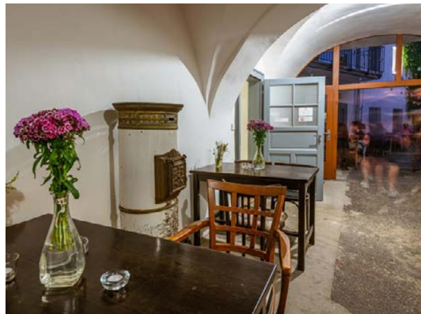
THE NATIONAL TRUST of Slovakia is working to preserve and find new use for Romer house in Bratislava.

As historical buildings are exempted from the obligation to meet the energy performance parameters they are partially protected from the incorrect application of simplified insulation and the risk of faulty implementations. On the other hand, Slovakia, unlike other developed countries, lacks more experience in improving their energy performance. Another reason for the lack of experience is the small construction market and the general shortage of specialists with the knowledge of monument restoration. Special energy-saving measures were implemented rather sporadically.