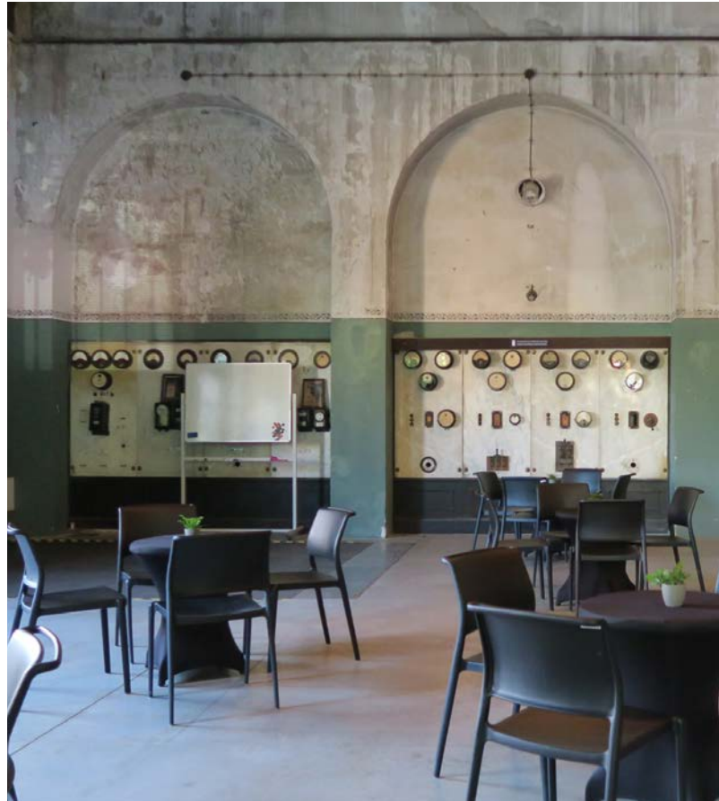
FROM THE ELEKTRARNA, PIESTANY.