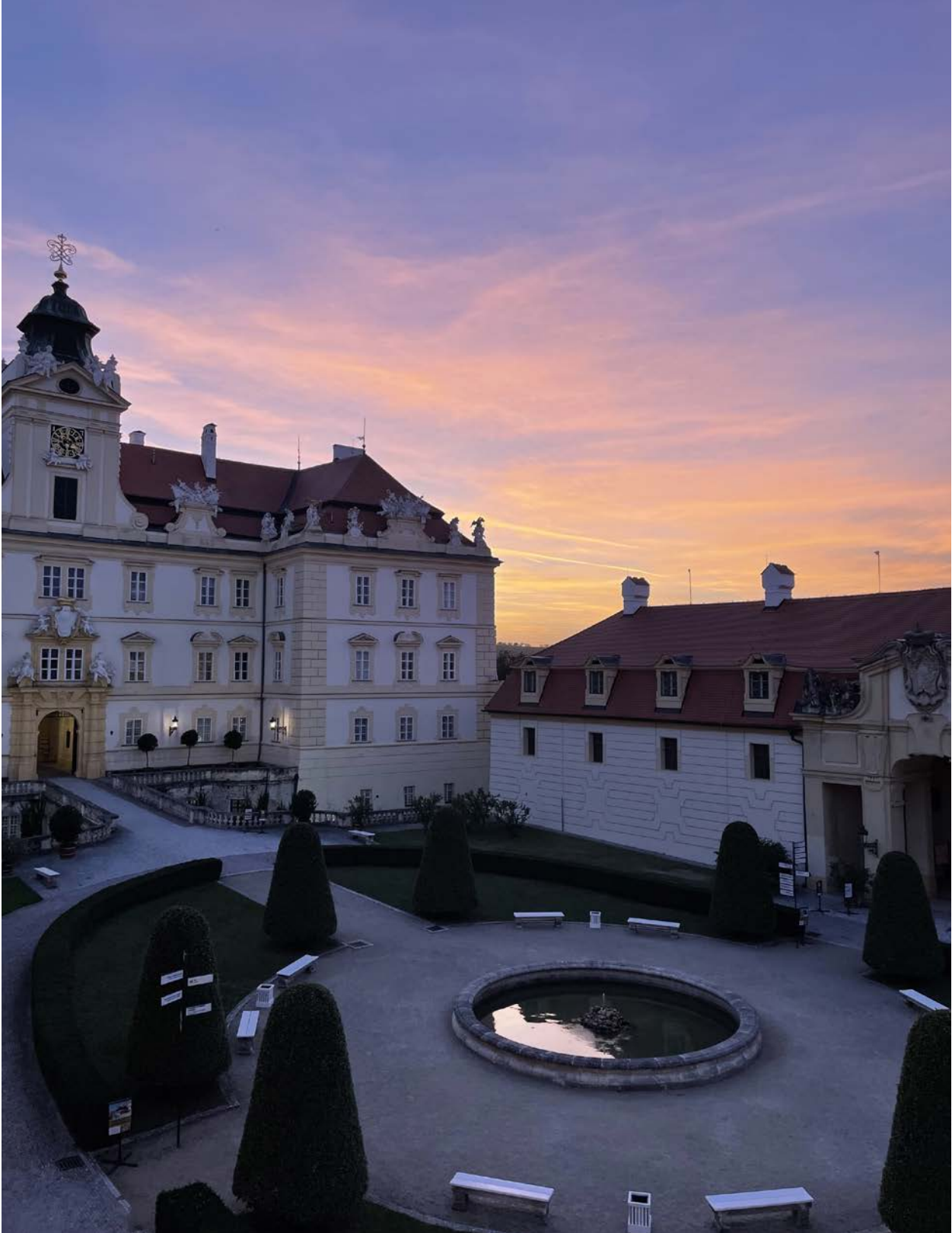
Valtice Castle.