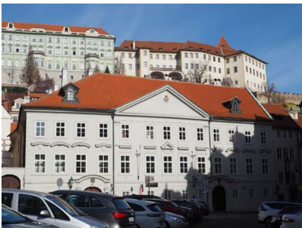
THE OFFICES OF the National Heritage Institute in Prague.

In relation to this engagement and activity, two working groups were set up, specifically the working group for climate change and cultural heritage, and the working group for the use of photovoltaic and other renewable energy sources in protected areas and on cultural monuments.