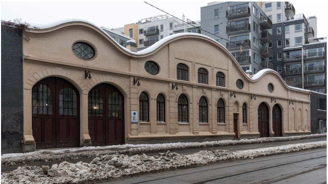
THE NORWEGIAN DIRECTORATE for Cultural Heritage is on the move to this protected building in Oslo.

The directorate has prioritised practical guidelines to help owners and managers of old houses. Publications include: a manual on solar panels and a manual on heat pumps, with focus on placement and aesthetics, a manual on small and medium energy efficiency measures in old buildings, and an online collection of best practices with pictures and details informing the public about possible good solutions.