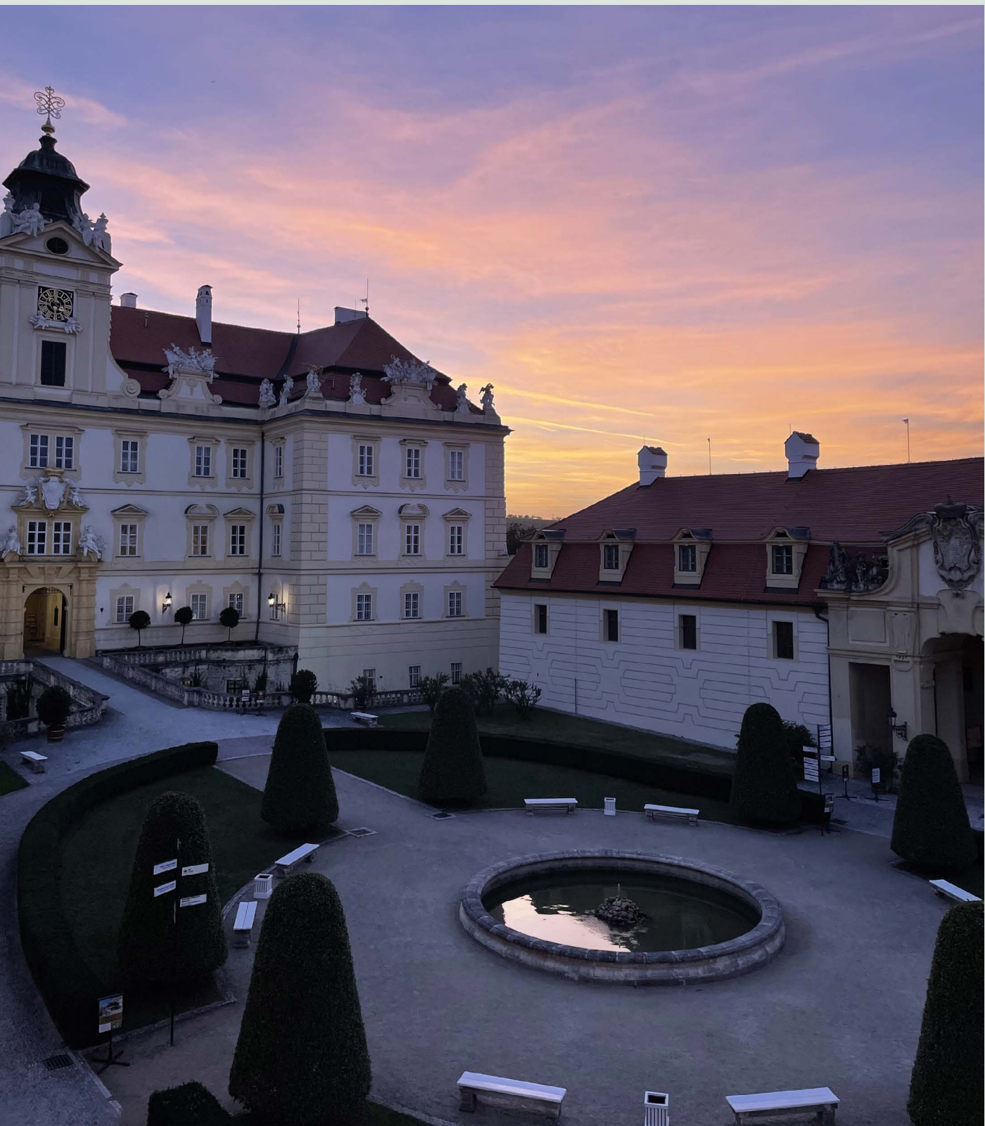
VALTICE CASTLE one of the sites of the symposium was Valtice Castle. A historical monument managed by the Czech National Heritage Institute.