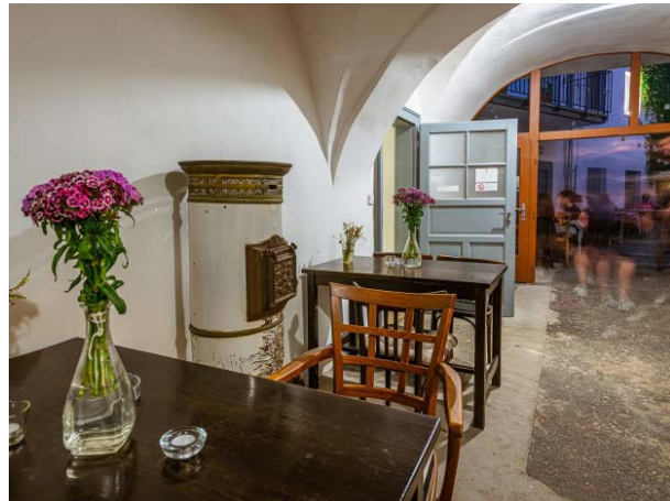
THE NATIONAL TRUST of Slovakia is working to preserve and find new use for Romer house in Bratislava.

As historical buildings are exempted from the obligation to meet the energy performance parameters they are partially protected from the incorrect application of simplified insulation and the risk of faulty implementations. On the other hand, Slovakia, unlike other developed countries, lacks more experience in improving their energy performance. Another reason for the lack of experience is the small construction market and the general shortage of specialists with the knowledge of monument restoration. Special energy-saving measures were implemented rather sporadically.