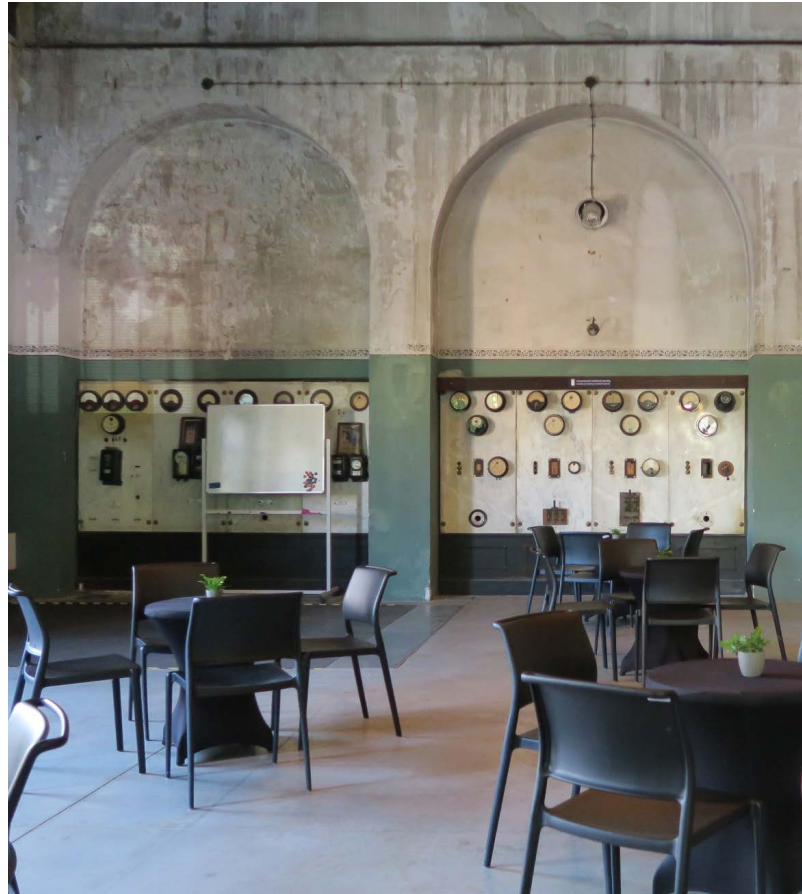
FROM THE ELEKTRÁRŇA, PIEŠŤANY.