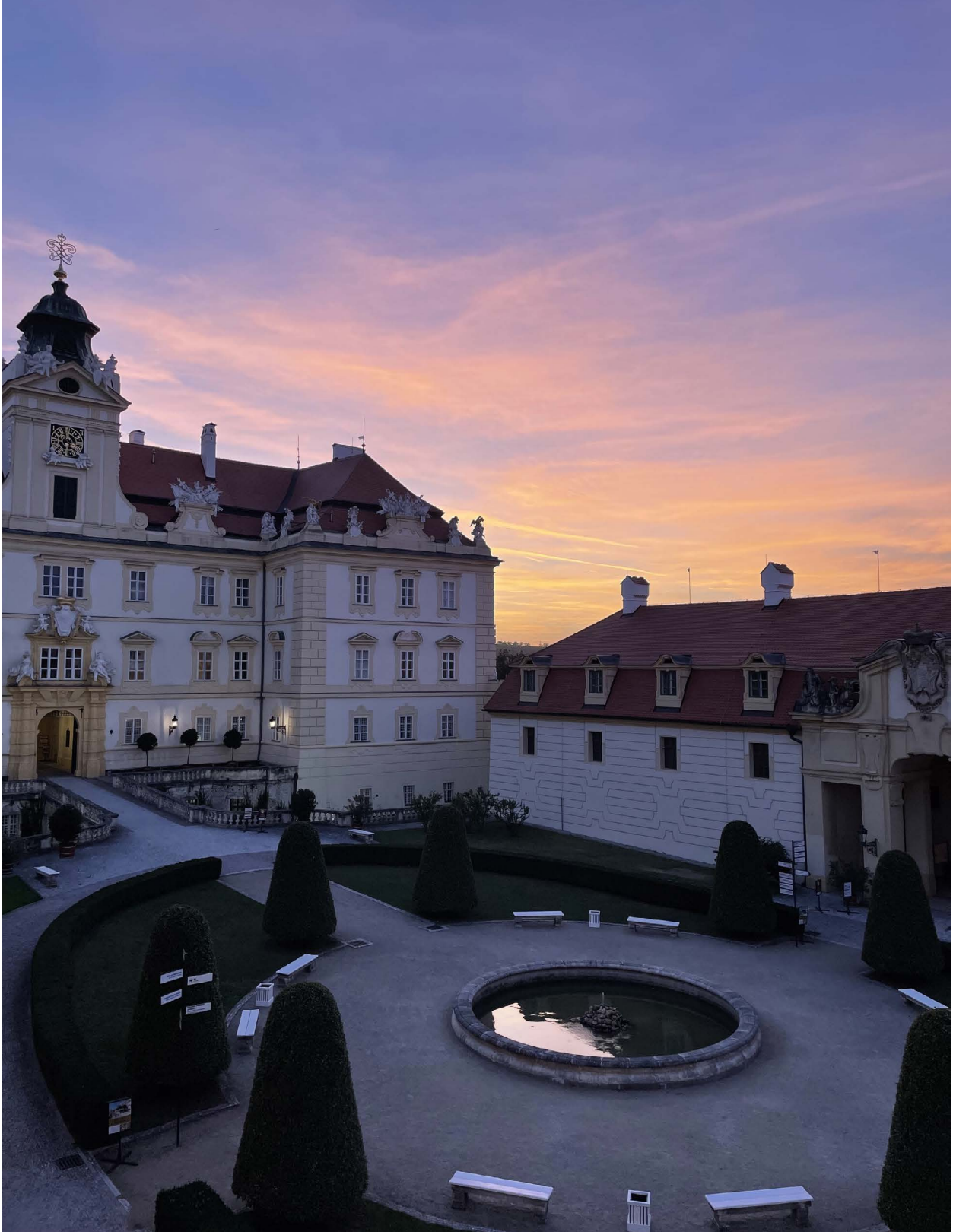
Valtice Castle.